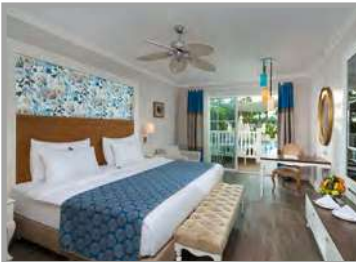
DELUXE POOL ROOM