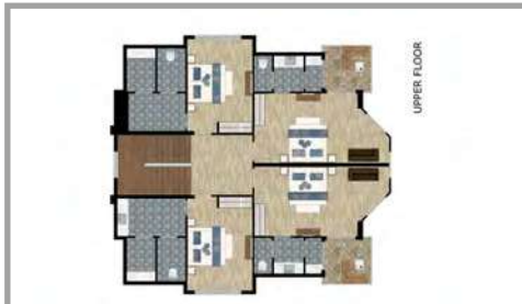
GROUND FLOOR SKETCH