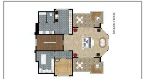
UPPER FLOOR SKETCH